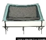
Cette tente est disponible sur demande