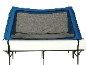
Cette tente est disponible sur demande