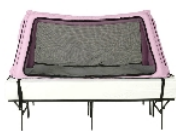
Cette tente est disponible sur demande